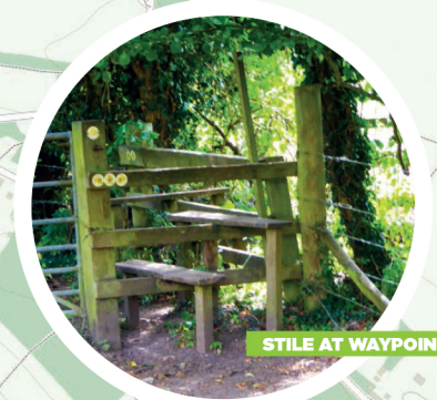
STILE AT WAYPOINT 3