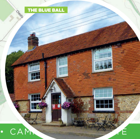
THE BLUE BALL