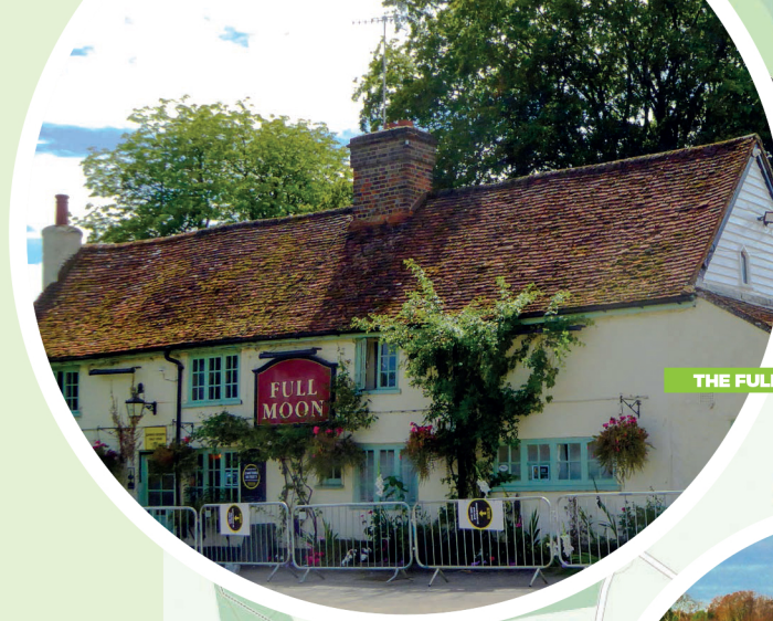
THE FULL MOON

Scan this QR code for more information about the River Chess Smarter Water Catchment project and link to this walk