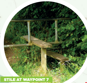
STILE AT WAYPOINT 7